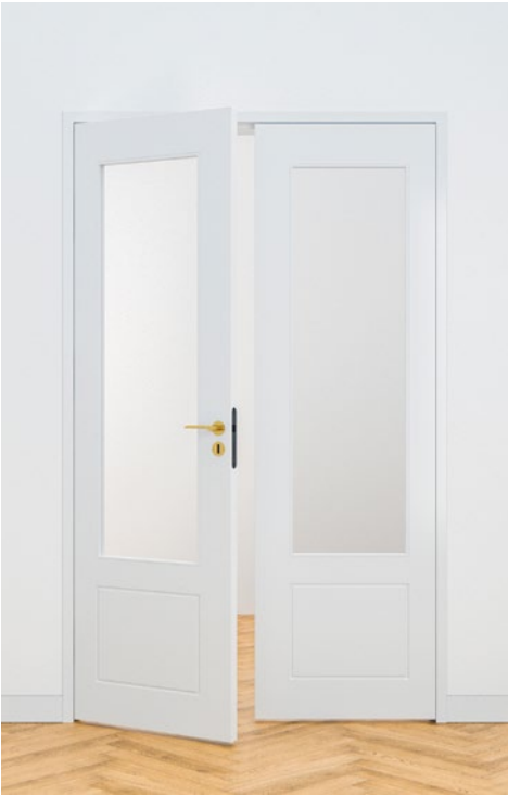
INTERIOR DOOR (LIVING ROOMS)

VARIATION Wooden, recessed panel doors with frames, fire safety, white lacquer