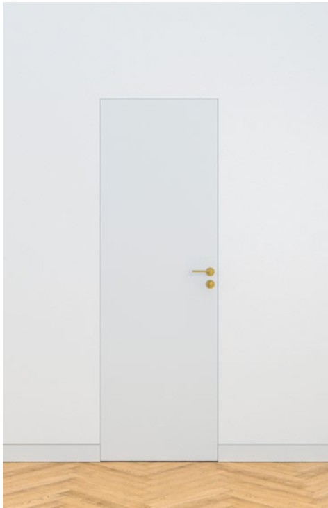
INTERIOR DOOR (TOILETS, BATHROOMS, LAUNDRY ROOMS)

VARIATION Wooden, rebateless with frames, full smooth, concealed hinges, magnetic lock, white lacquer