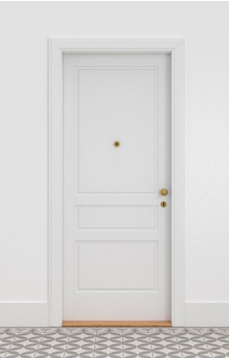
APARTMENT ENTRANCE DOOR