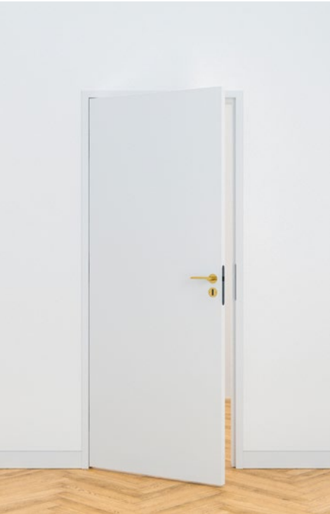
INTERIOR DOOR (ROOMS)

VARIATION Wooden, double-wing, glass panels, frames, concealed hinges, magnetic lock, white lacquer, safety glass